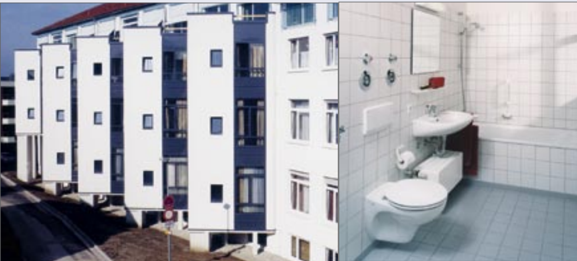
New facade via construction of front sanitation towers All fixtures are expertly pre-installed

Property-based approaches to solutions without restricting planning flexibility