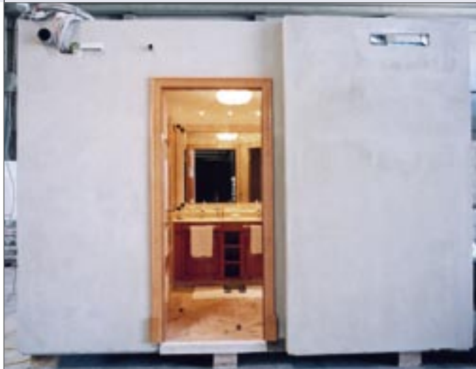
Completely finished at the factory