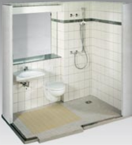
Modular bathrooms for subsequent installation

Low-priced, on-time, built to order – our ready-built bathrooms are unbeatable!