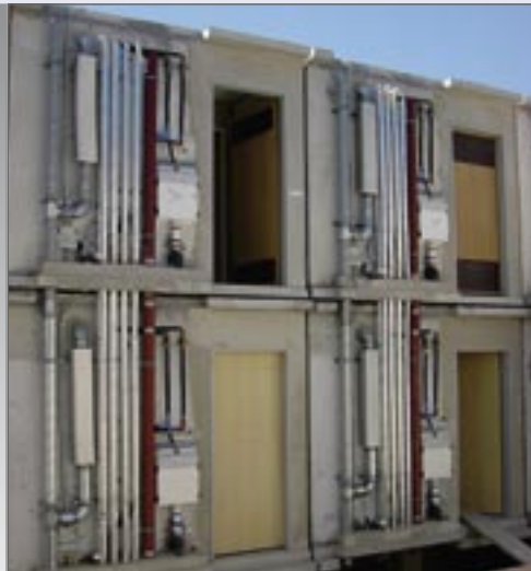
Enclosed bathroom units

No matter what requirements you have for ready-built bathrooms – practical and modern, or exclusively upmarket – we will design them to your specifications, handle all technical details with expert planners on site and prefabricate all bathrooms entirely in our own production facilities.