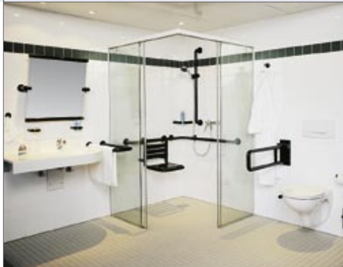
Handicapped accessible ready-built bathroom built to DIN standard