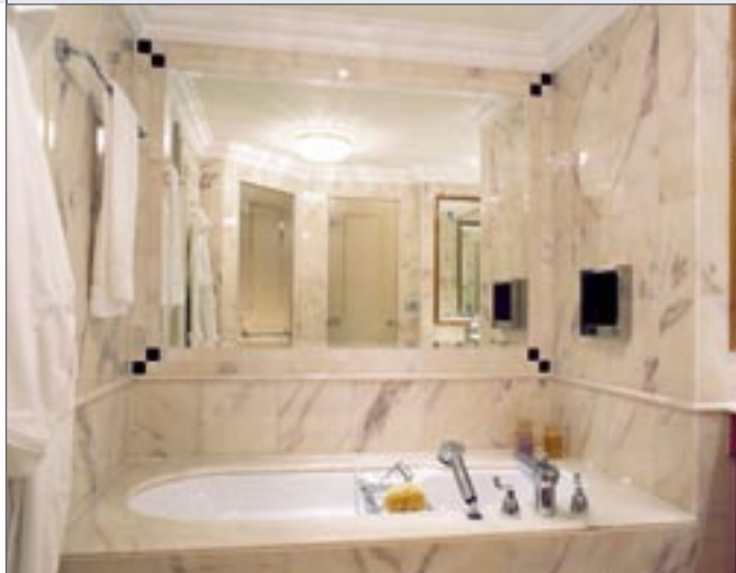
Compact ready-built bathrooms for luxury hotels