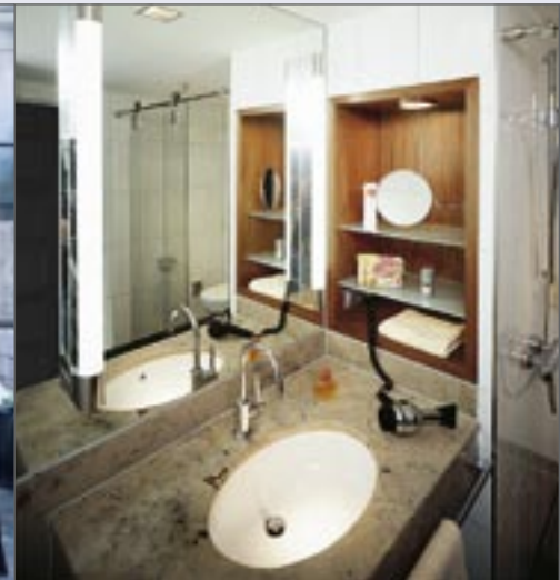
Fine, uncompromising furnishings

Twelve weeks of construction time saved means more financial leeway.