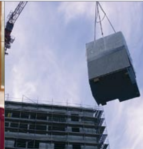
Ready for crane-assisted installation

“If you do not think about the future, you cannot have one“