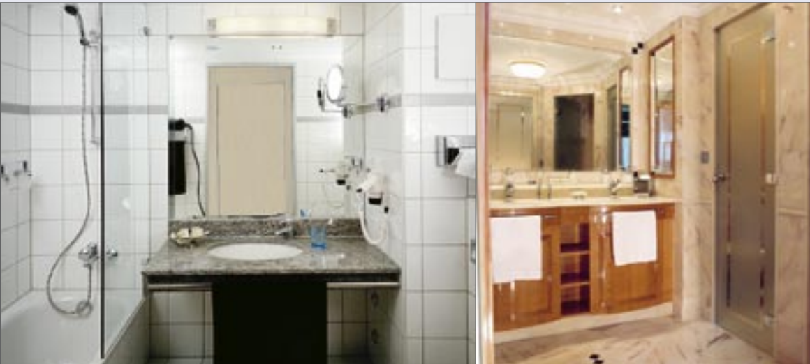
Tiles, washstand, bathroom furnishings – exactly to customer wishes For new construction and renovation

“ www.fertigbad.info ” for more information